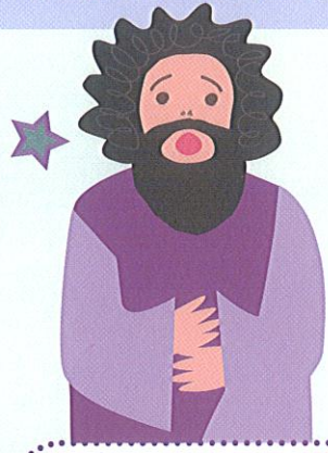
This is a friend of Jesus who is worried about him leaving.

Jesus says he has to leave his friends, but he is sending a special helper to be with them. Jesus is sending the Holy Spirit. No one needs to be worried or afraid, Jesus is giving us all his peace.